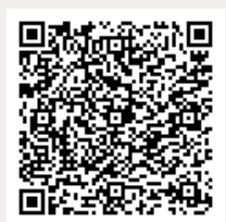
Scan QR Code